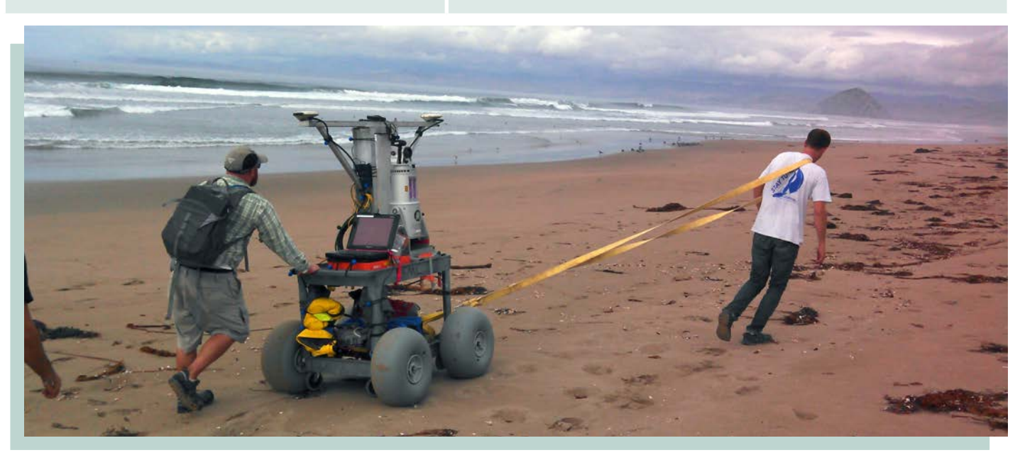
CSU Monterey Bay-CSU Fresno team mapping the Morro Bay sand spit using a terrestrial laser scanner.