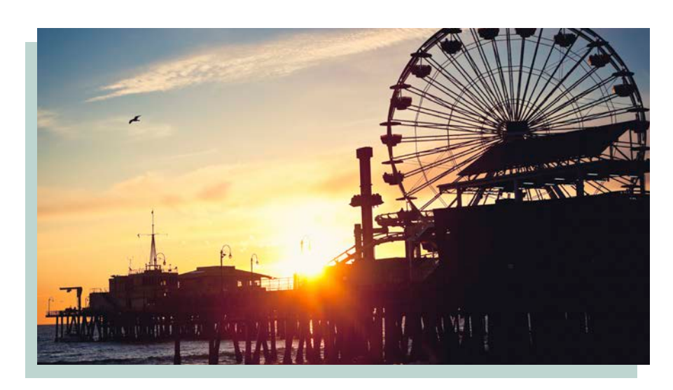
Santa Monica Pier at sunset.

As the umbrella organization for marine and coastal related activities within the California State University (CSU), the Council on Ocean Affairs, Science and Technology (COAST) supports marine and coastal research and education throughout the CSU and the state. We are dedicated to advancing our knowledge of California's natural coastal and marine resources and the processes that affect them. To accomplish this, we integrate system-wide resources, promote interdisciplinary multi-campus collaborations, and invest in CSU faculty members and their students. We also promote the dissemination of scientific information to decision makers and the public for the development of responsible policy statewide. This allows legislators, policy makers and resource managers to protect our coastal resources and safeguard their sustainable use for future generations, thus ensuring the economic well being of California and the nation.