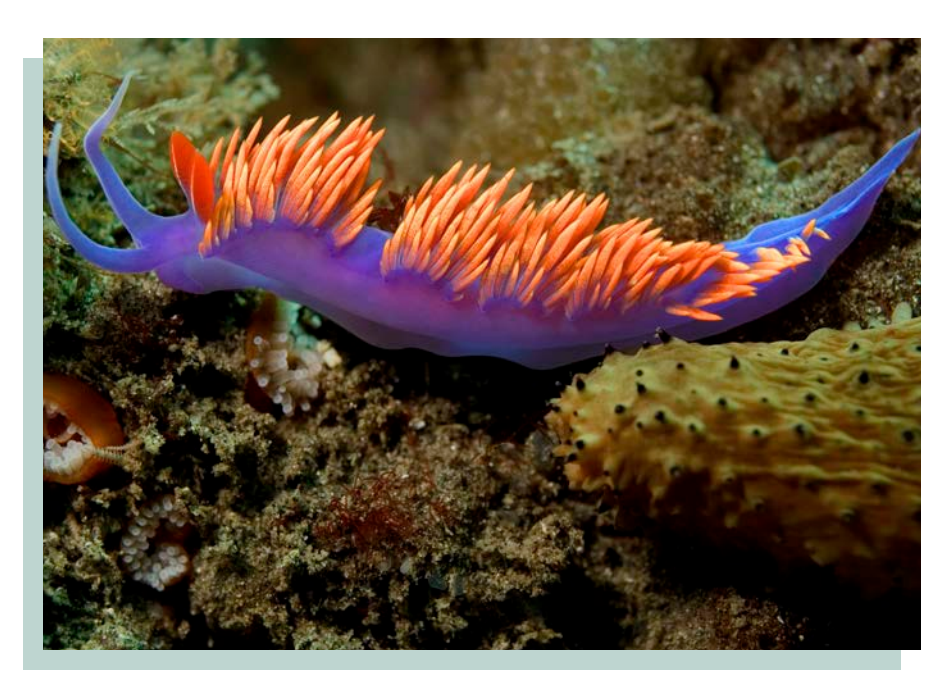
Spanish Shawl nudibranch, Flabellina iodinea.

• The Grant Development Program (GDP), initiated in 2013, replaces CRSP with broader-use seed funding intended to be more attractive to a larger audience. GDP aims to increase 1) the total amount of extramural funding for marine and coastal related research and education and 2) the number of externally funded marine and coastal related PIs throughout the CSU by providing funding to CSU teaching and research faculty to support the development of proposals for extramural funding. Awards are intended to support activities deemed necessary to maximize subsequent success in obtaining external funding such as data collection and/or generation (e.g., field work, surveys, sample analysis), student support, or assigned time funding (for tenured/tenure-track faculty only).