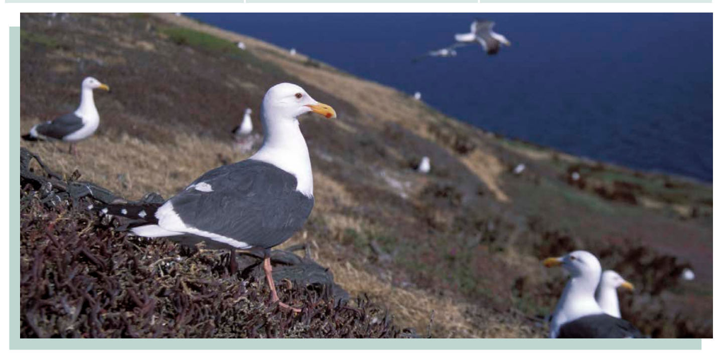
Seagulls on Channel Islands.