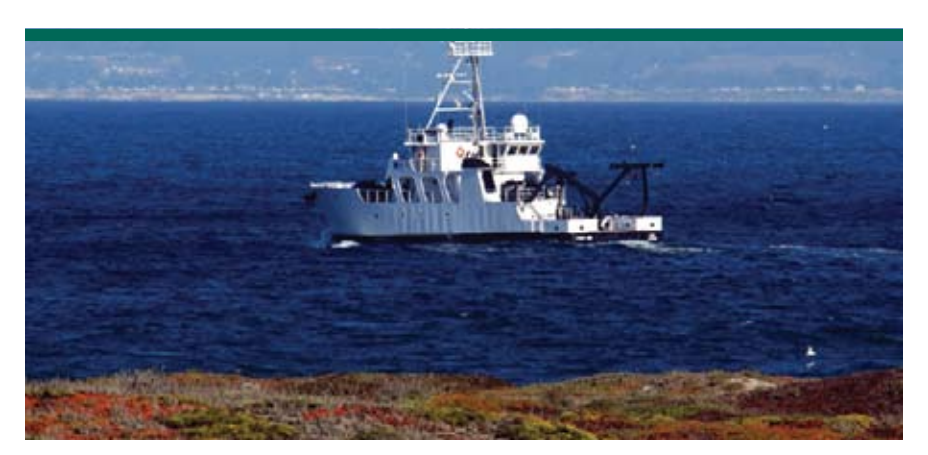
University-National Oceanographic Laboratory System (UNOLS) R/V \it Point Sur housed at Moss Landing Marine Laboratories.