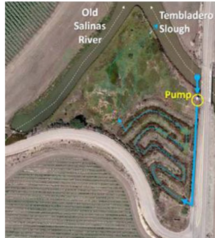
Molera Treatment Wetland in Castroville, CA